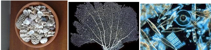
Plate 6. Other categories of marine animals considered that remains seashells