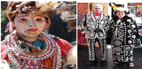
Plate 10. Seashells used for personal adornment