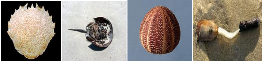
Plate 5 Shells of some marine invertebrates