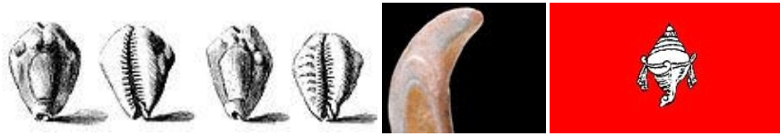
Plate 7. Some uses of sea shells