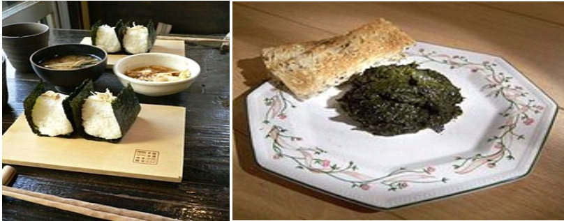
Plate 13 Seaweed products