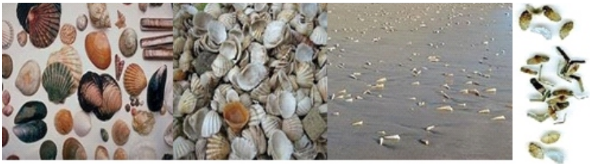
Plate 2 Sea Shells