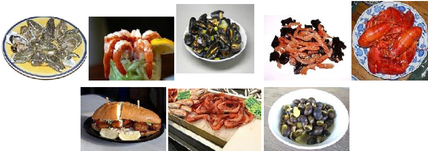
Plate 1. Some popular dishes using shellfish