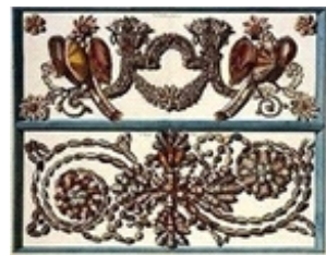
Plate 11.craft from seashell