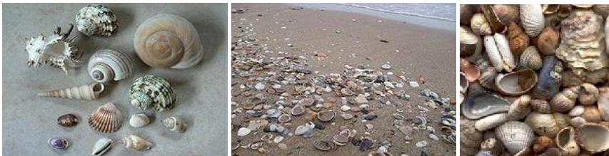
Plate 4 Many Mollusk species and families