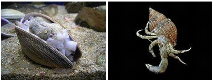
Plate 8 .Molluscan seashells used for protection by other animals Source: Abowei and Ezekiel, 2013c